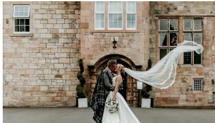
DALMENY PARK GLASGOW

Seamill Hydro Hotel is a romantic Victorian venue with mesmerising views of the Firth of Clyde and Mountains of Arran, making it the perfect setting for your special day.