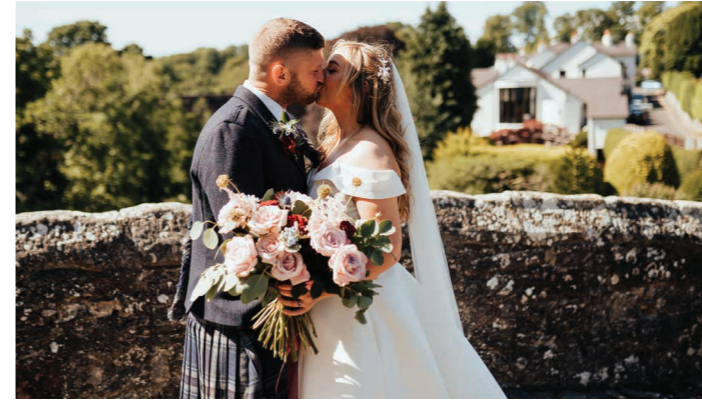
BRIG O' DOON ALLOWAY

Hetland Hall Hotel is an elegant country house set amidst picturesque gardens and grounds. The romantic ceremony suite offers sweeping views of the Solway Firth with stylish interiors, we can think of no better setting.