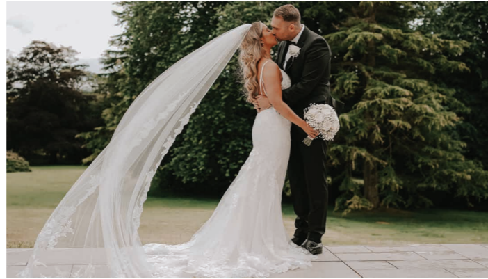
HETLAND HALL DUMFRIES

The Radstone Hotel is tucked away in rural Lanarkshire. Set in its own extensive grounds with striking scenery and landscaped gardens.