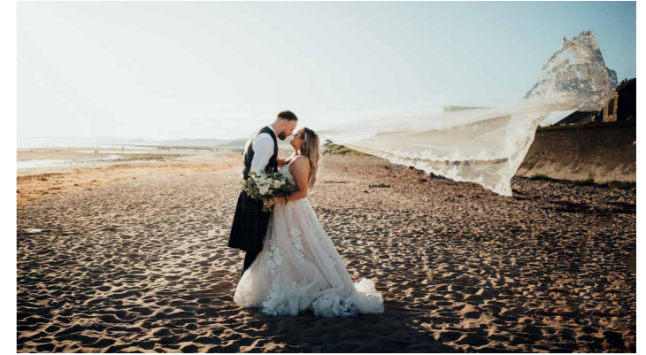
SEAMILL HYDRO WEST KILBRIDE

Brig o' Doon is an iconic venue set amidst several acres of perfectly manicured grounds. Located in the heart of historic Ayrshire, it is one of Scotland's most well-known venues.